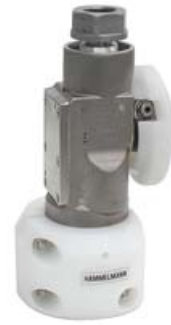
Type L 1200-2 with impact protection 56 mm lever arm, 2 nozzles max. 1200 bar / 200 l/min. Min. Tank access: 140 mm