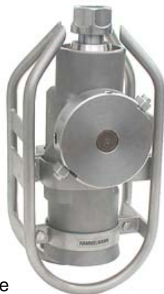
Type XL 1600-2 with protective 18 mm discarm, 2 nozzles max. 1600 bar / 250 l/min. Min. Tank access: 200 mm