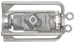
Type L 1200-2 with sledge for cleaning pipes with bends 18 mm S-arm, 2 nozzles max. 1200 bar / 200 l/min. Min. Pipe -Ø: 210 mm