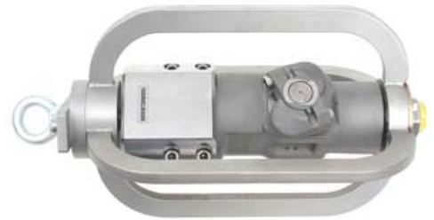
Type XL 1600-2 with sledge for pipe cleaning 35 mm S-arm, 2 nozzles max. 1600 bar / 250 l/min. Min. Pipe -Ø: 320 mm