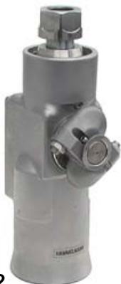
Type XL 500-2 Chemical version 35 mm lever arm, 2 nozzles max. 500 bar / 400 l/min. Min. Tank access: 190 mm

Here are some examples from our wide range: