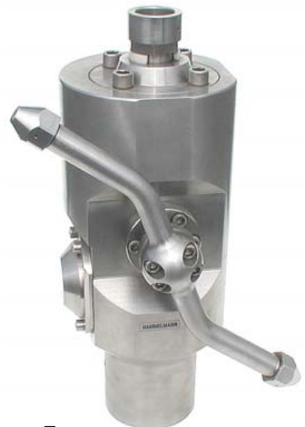
Type XXL 1500-2 56 mm lever arm, 2 nozzles max. 1500 bar / 500 l/min. Min. Tank access: 500 mm