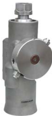
Type XL 1600-2 13 mm V-arm, 2 nozzles max. 1600 bar / 250 l/min. Min. Tank access: 190 mm